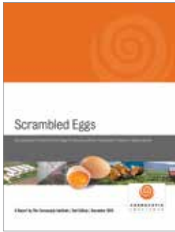
Scrambled Eggs: Separating Factory Farm Egg Production from Authentic Organic Agriculture, 2nd edition.