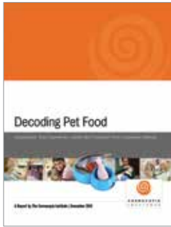
Decoding Pet Food: Adulteration, Toxic Ingredients, and the Best Choices for Your Companion Animals