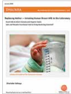
Replacing Mother— Imitating Human Breast Milk in the Laboratory. Novel oils in infant formula and organic foods: Safe and valuable functional food or risky marketing gimmick?