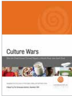
Culture Wars: How the Food Giants Turned Yogurt, a Health Food, into Junk Food