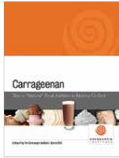
Carrageenan: How a “Natural” Food Additive is Making Us Sick