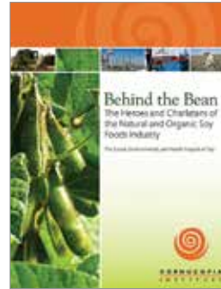
Behind the Bean. The Heroes and Charlatans of the Natural and Organic Soy Foods Industry