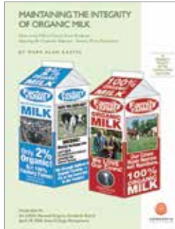
Maintaining the Integrity of Organic Milk: Showcasing ethical family farm producers, exposing the corporate takeover — factory farm production